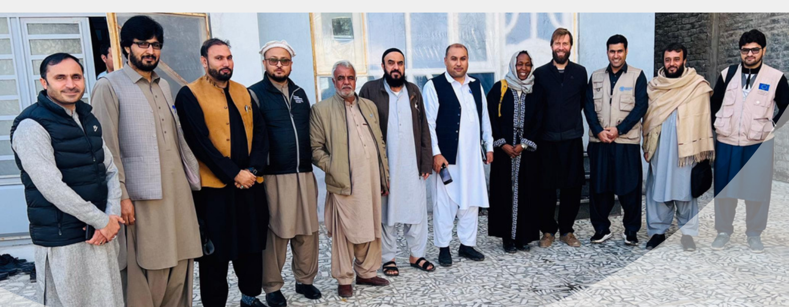
FGA management team and European Commission delegation's mission to Badghis province