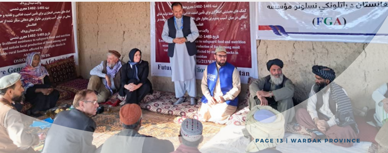
FAO & FGA Management team's mission to Nerkh district of Wardak province.